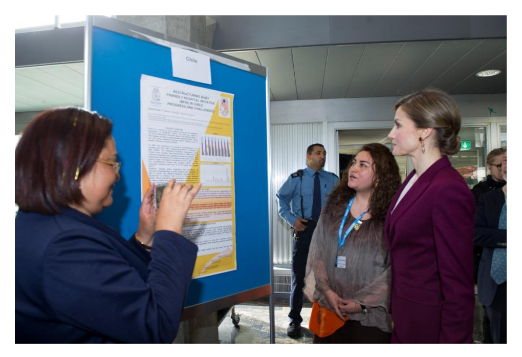
Queen Letizia Ortiz Rocasolano of Spain discusses poster presentations with Congress participants.

Participants had numerous other opportunities for learning and networking. Regional groupings of countries met twice during the Congress to enable cooperation among countries and commit to supporting implementation and follow up after the BFHI Congress. An evening reception, breaks and lunches allowed participants to interact informally. Thirty countries presented posters on BFHI implementation, compliance with the Code, certification processes and contextual adaptations.